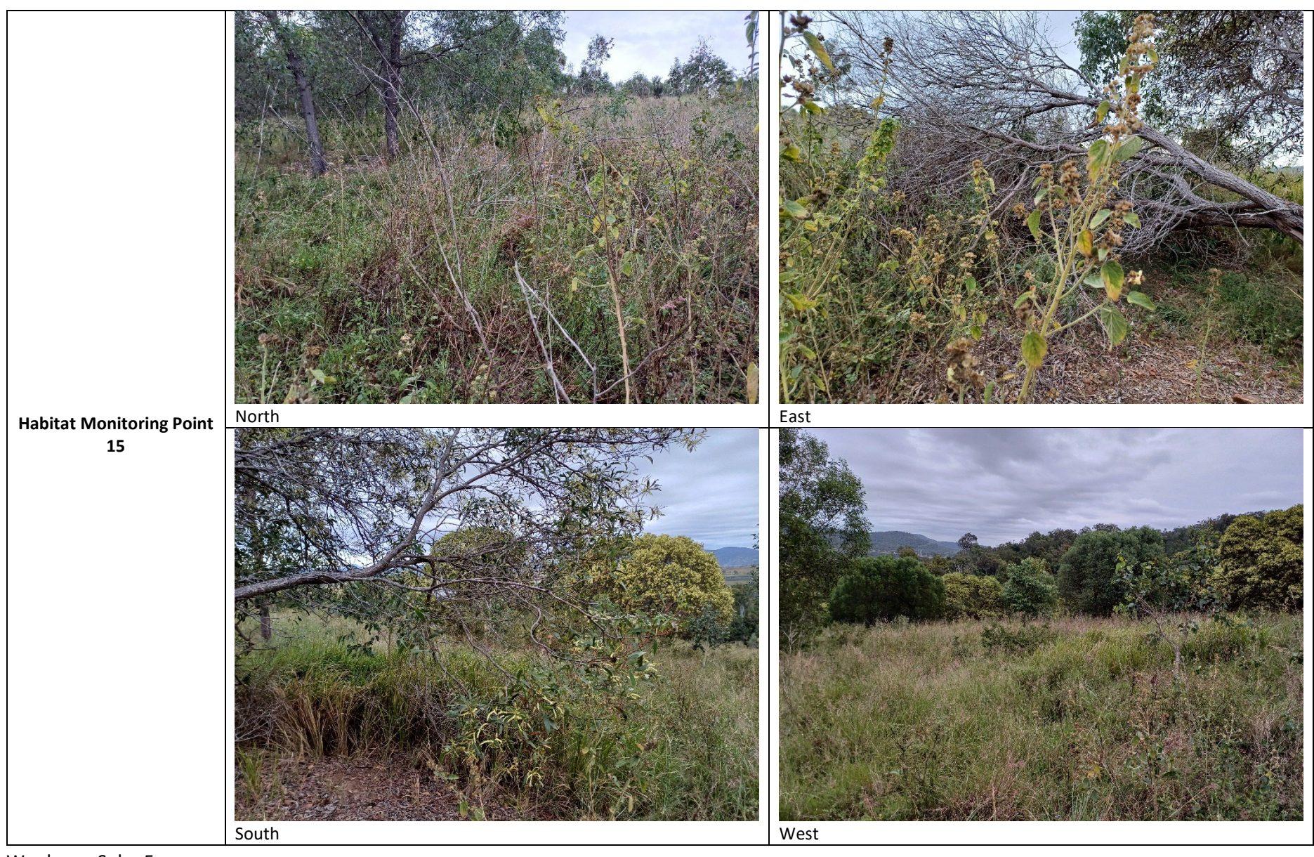
Woolooga Solar Farm, Lower Wonga, Queensland (EPBC 2019/8554)