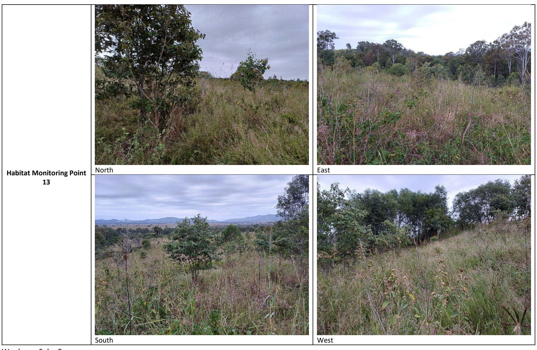
Woolooga Solar Farm, Lower Wonga, Queensland (EPBC 2019/8554)