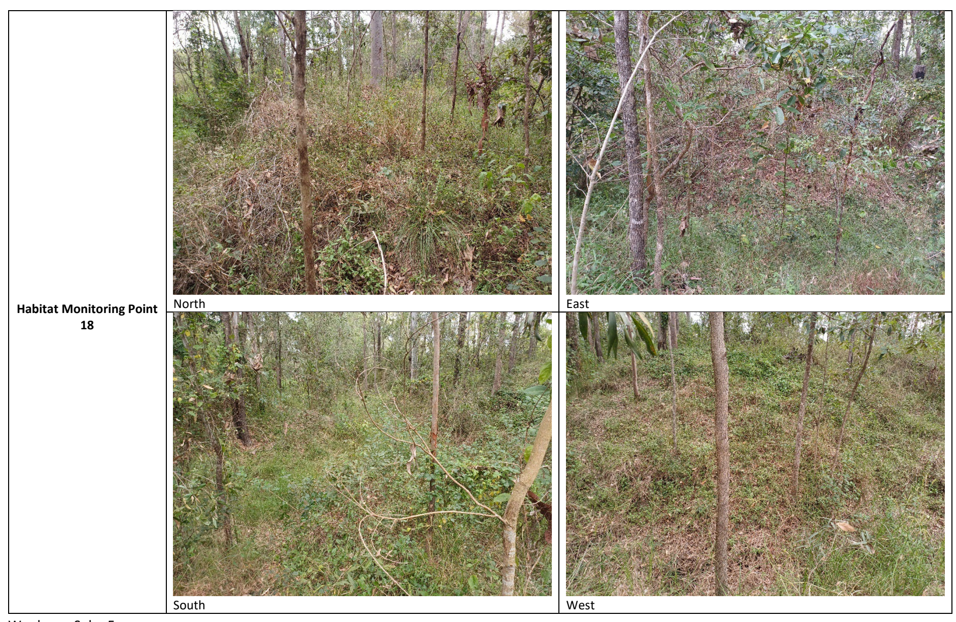
Woolooga Solar Farm, Lower Wonga, Queensland (EPBC 2019/8554)