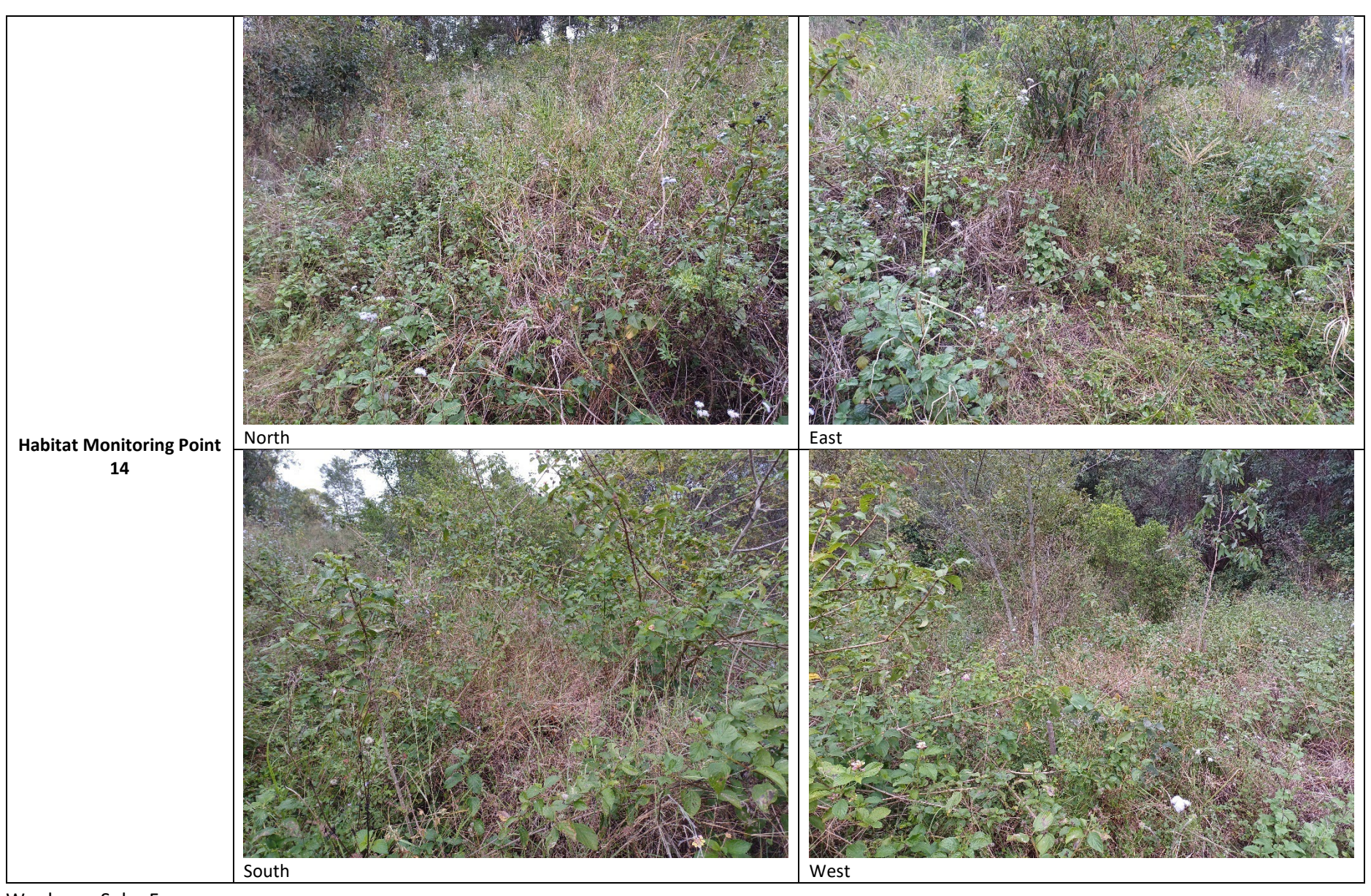
Woolooga Solar Farm, Lower Wonga, Queensland (EPBC 2019/8554)