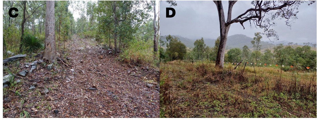
A-Main entrance gate, B-Waterway barrier crossing, C-Access track and D-Fence with visibility tags

Woolooga Solar Farm, Lower Wonga, Queensland (EPBC 2019/8554)