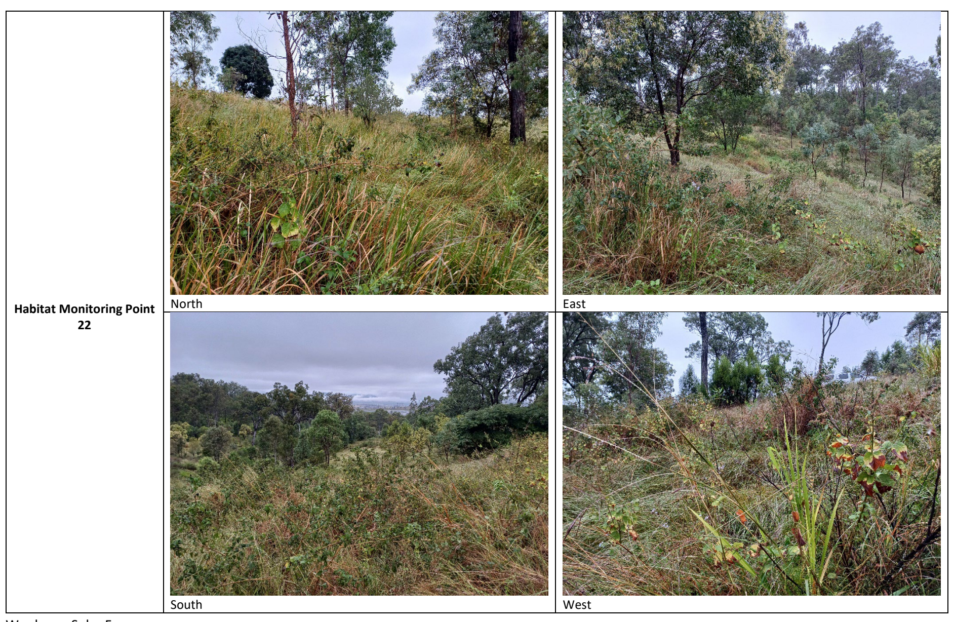
Woolooga Solar Farm, Lower Wonga, Queensland (EPBC 2019/8554)