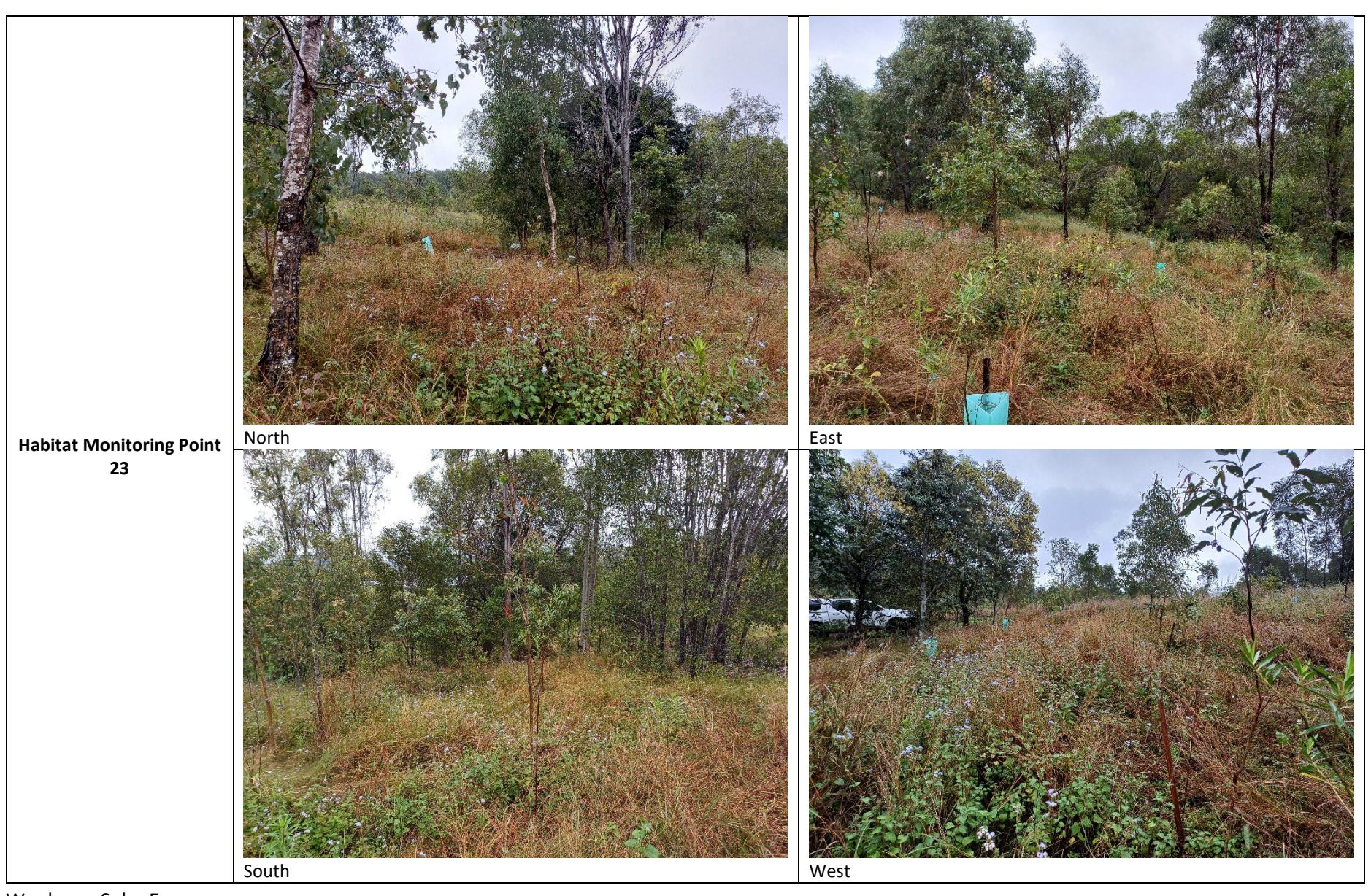
Woolooga Solar Farm, Lower Wonga, Queensland (EPBC 2019/8554)