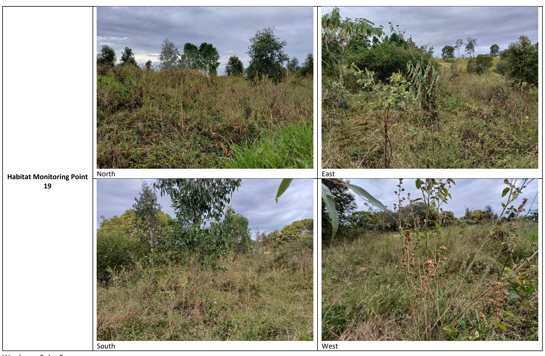
Woolooga Solar Farm, Lower Wonga, Queensland (EPBC 2019/8554)