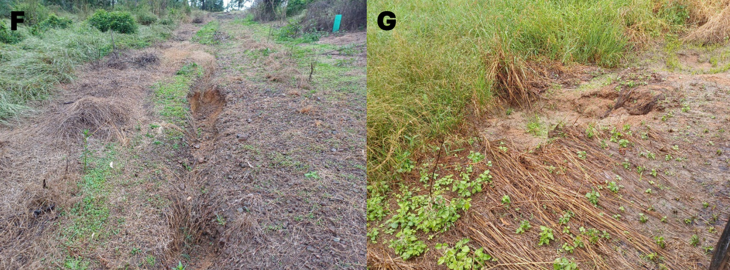
A-Erosion point 1, B-Erosion point 2, C-Erosion point 3, D-Erosion point 4, E-Erosion point 5, F-Erosion point 6 and G-Erosion point 7. Woolooga Solar Farm, Lower Wonga, Queensland (EPBC 2019/8554)