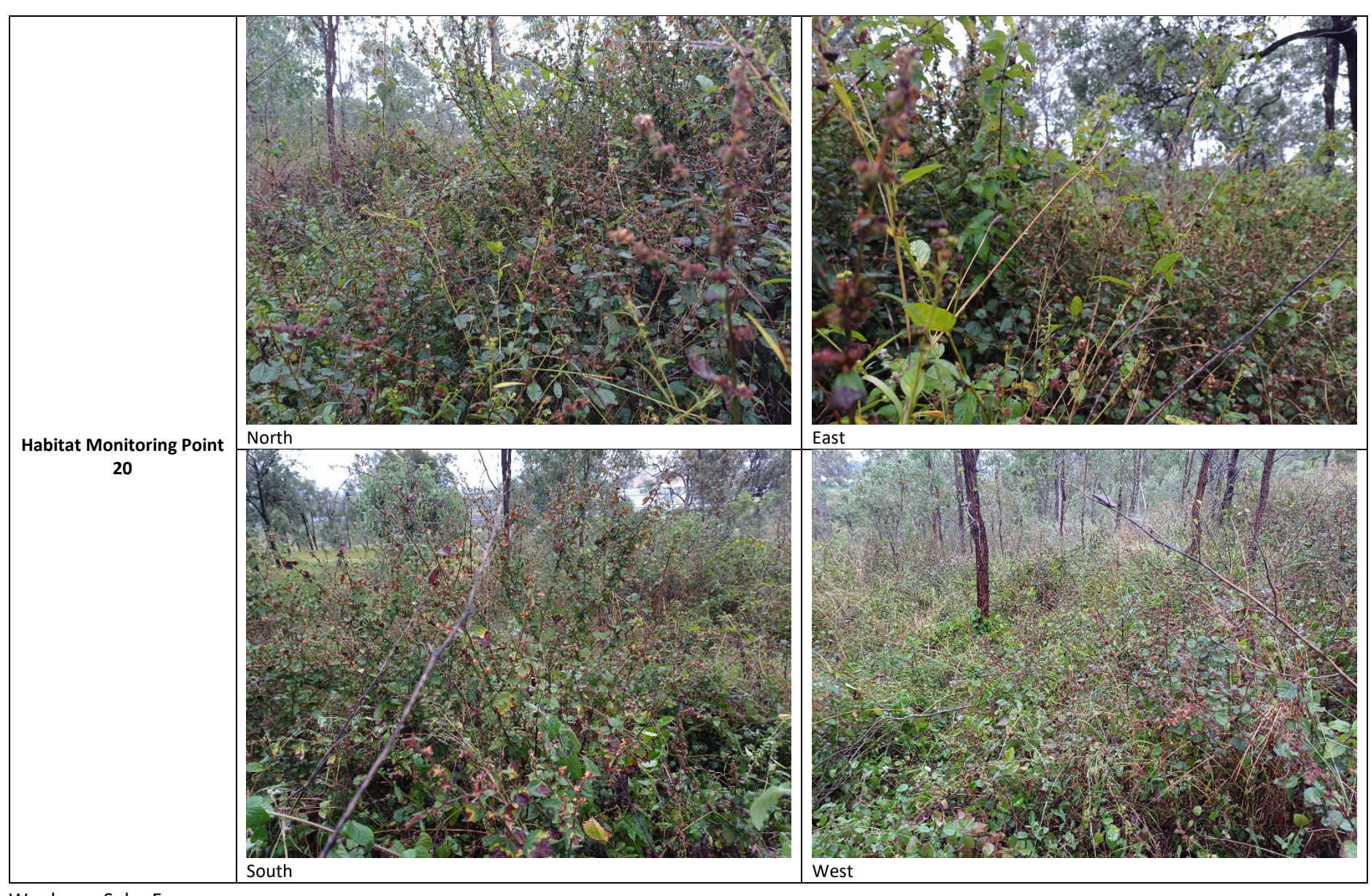
Woolooga Solar Farm, Lower Wonga, Queensland (EPBC 2019/8554)