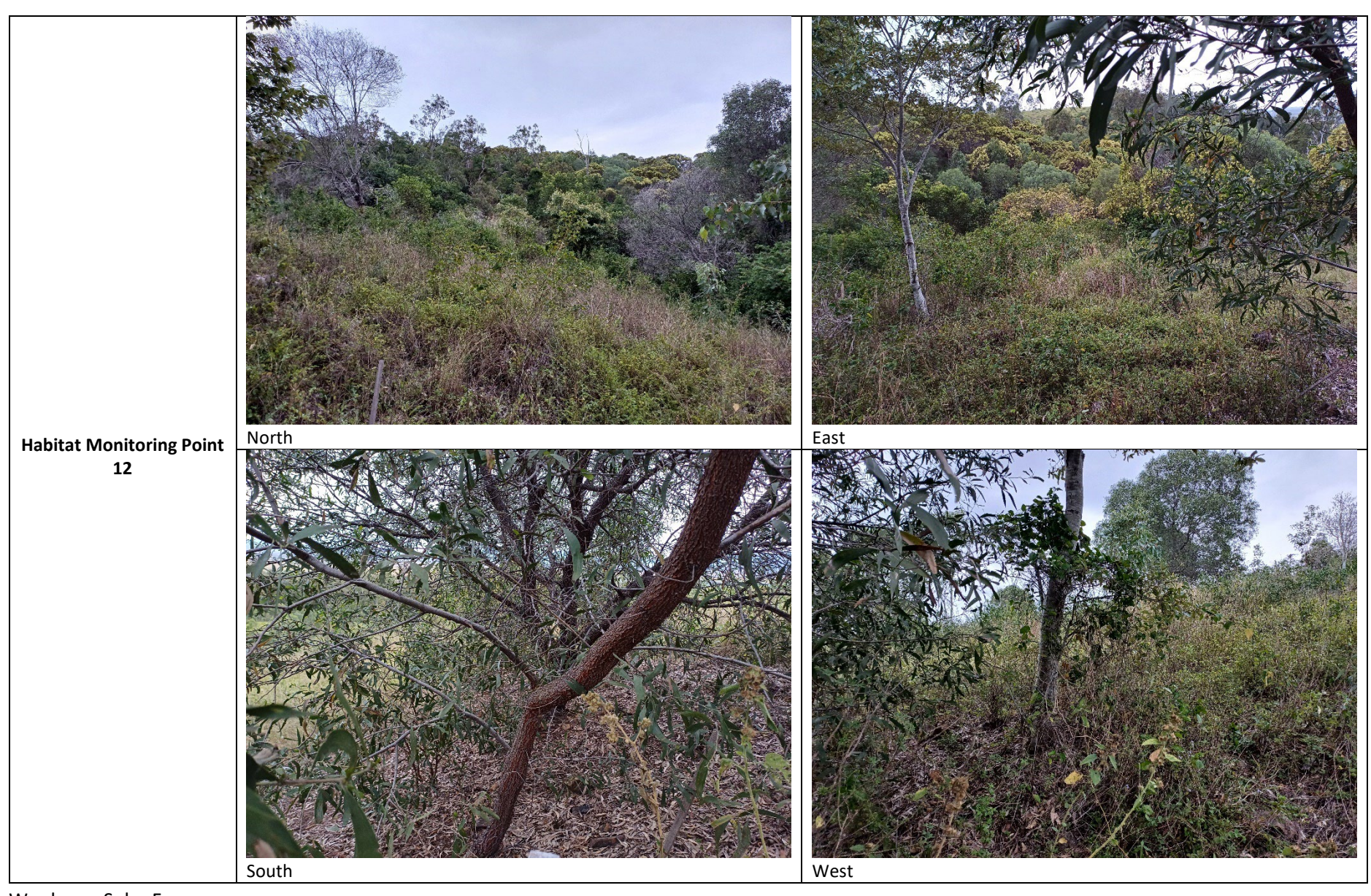
Woolooga Solar Farm, Lower Wonga, Queensland (EPBC 2019/8554)