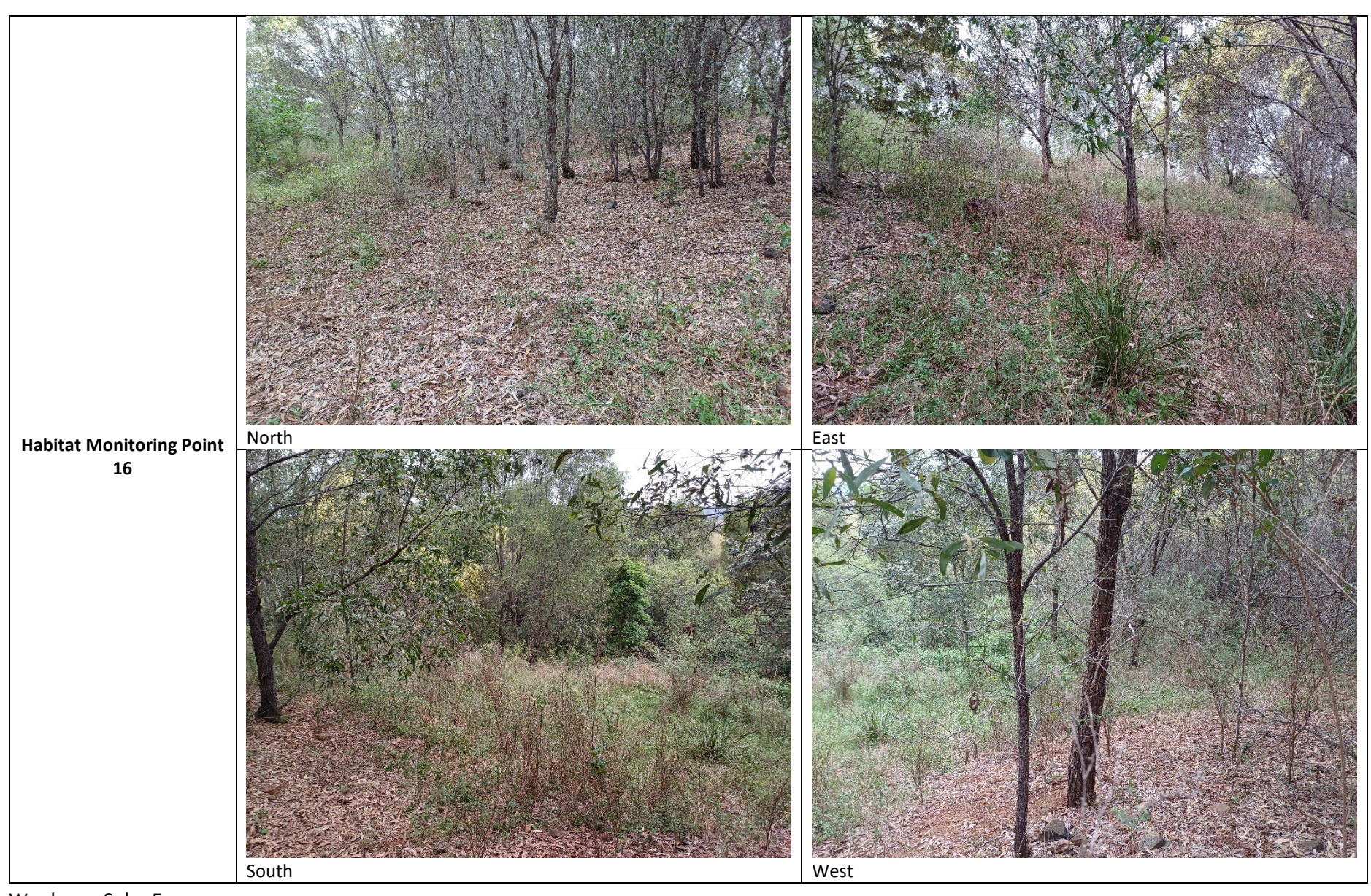
Woolooga Solar Farm, Lower Wonga, Queensland (EPBC 2019/8554)