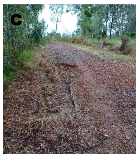
Woolooga Solar Farm, Lower Wonga, Queensland (EPBC 2019/8554)