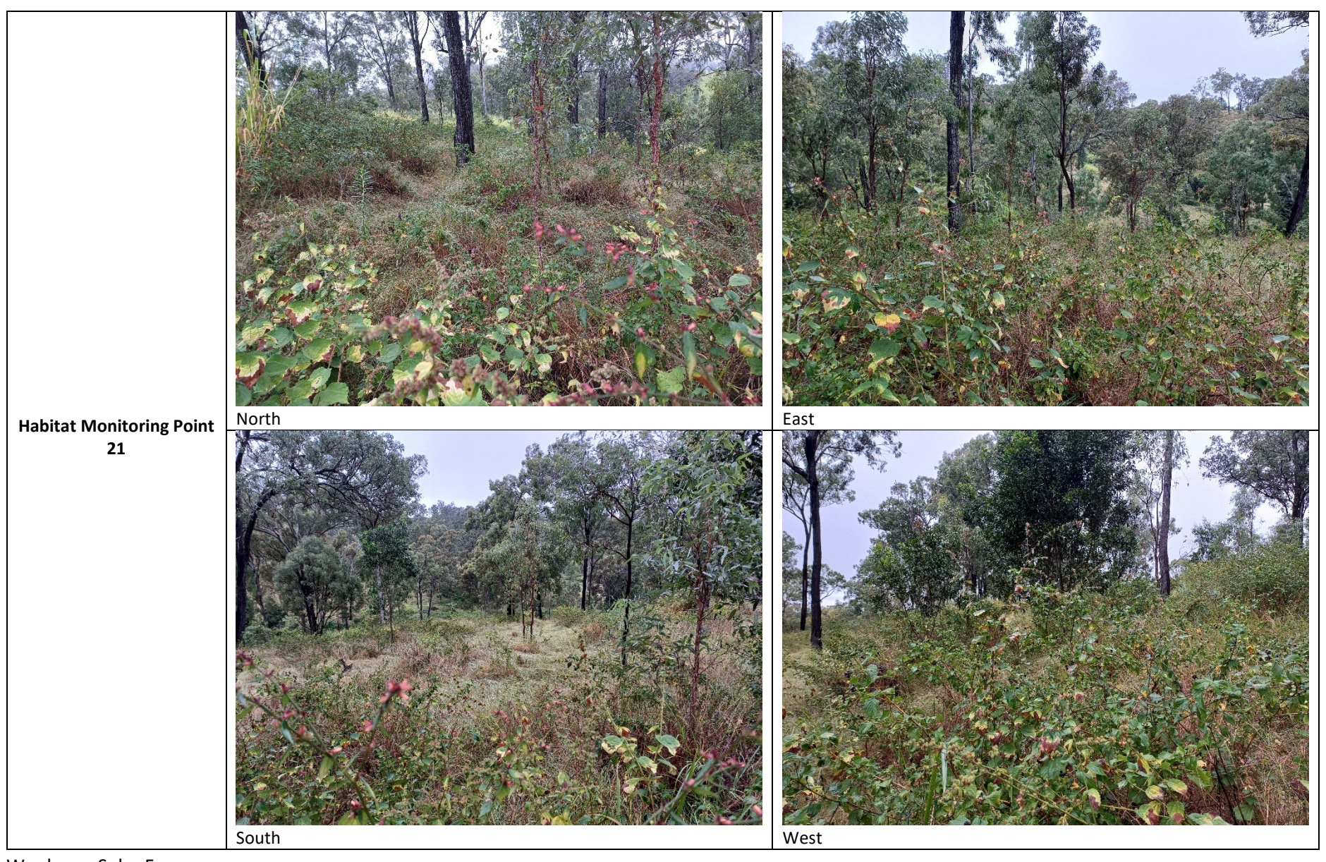
Woolooga Solar Farm, Lower Wonga, Queensland (EPBC 2019/8554)