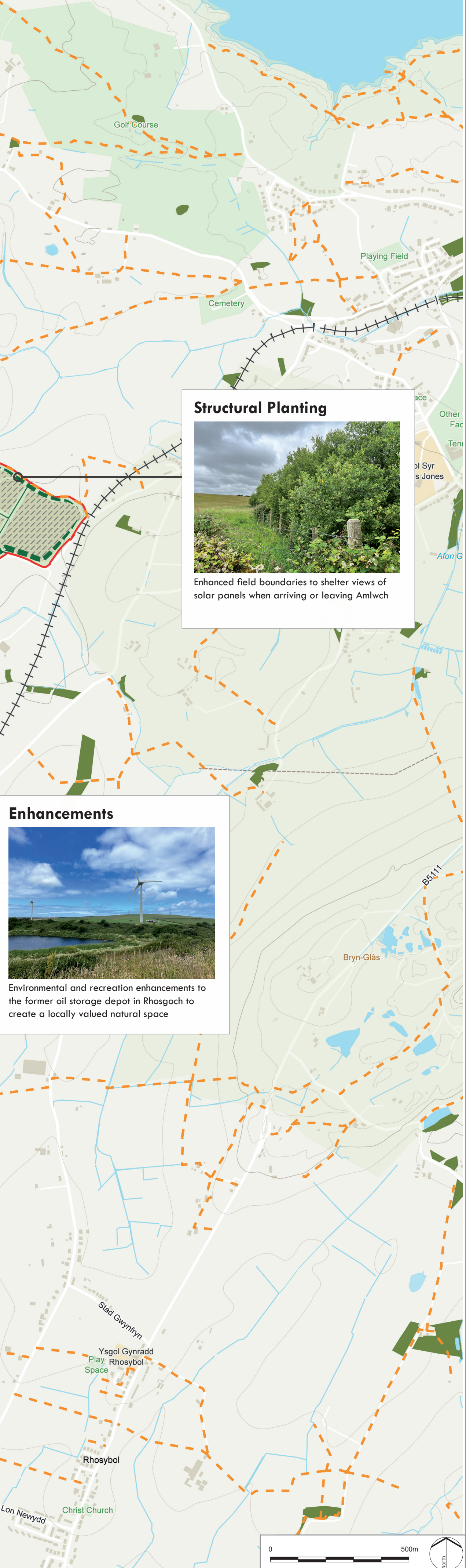
the former oil storage depot in Rhosgoch to