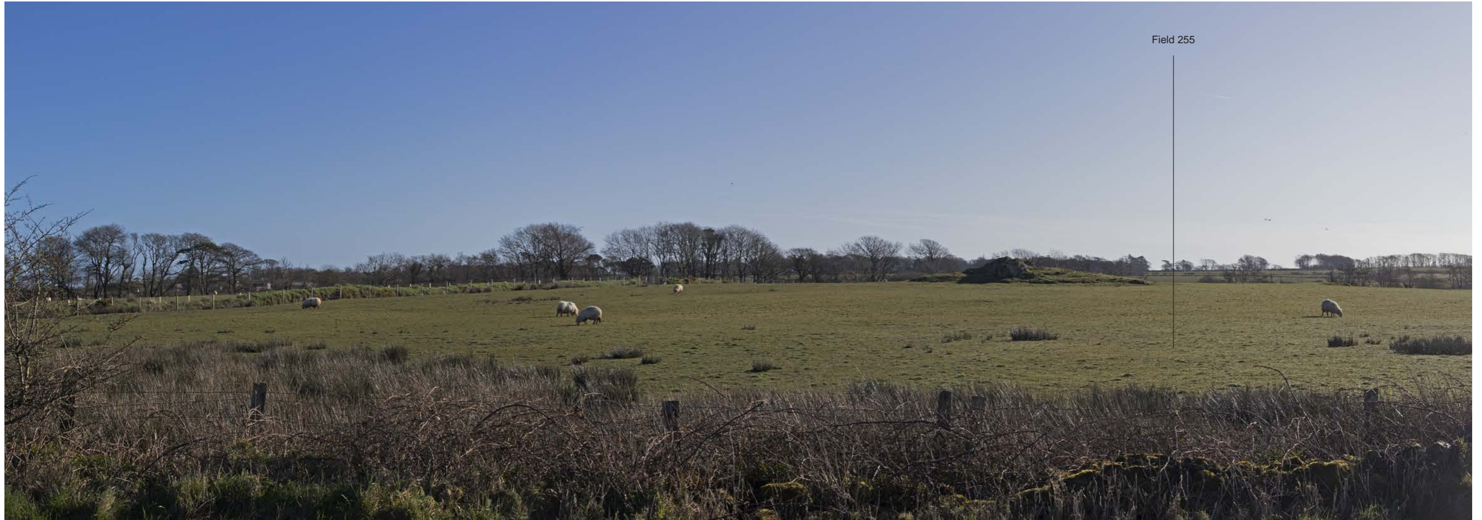
Representative Viewpoint 24 (Centre) - B5111 highway near layby and Pont Glan-rhyd between Llannerch-y-medd and Rhosmeirch

ISSUED BY Bristol T: 0117 2033 628 DATE September 2024 DRAWN BF PAGE SIZE 420mm x 297mm CHECKED RF STATUS Final APPROVED RF