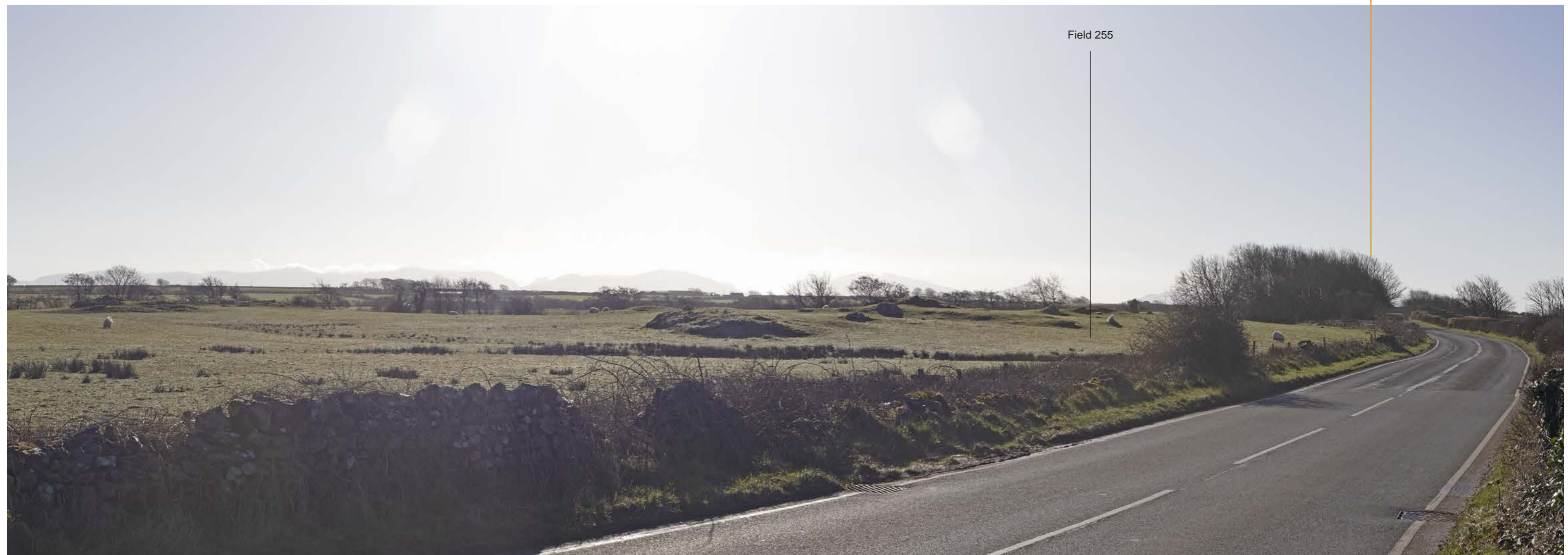
Representative Viewpoint 24 (Right) - B5111 highway near layby and Pont Glan-rhyd between Llannerch-y-medd and Rhosmeirch

Approximate extent of Maen Hir South 'B'