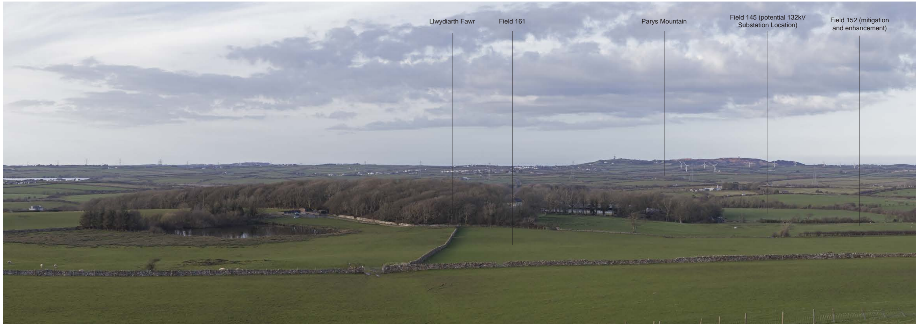
Representative Viewpoint 18 (Centre Left) - Public footpath LLANNERCH-Y-MEDD|25/002/1 near Pen-y-Foel and Llwydiarth Tower

Approximate extent of Maen Hir South 'A'