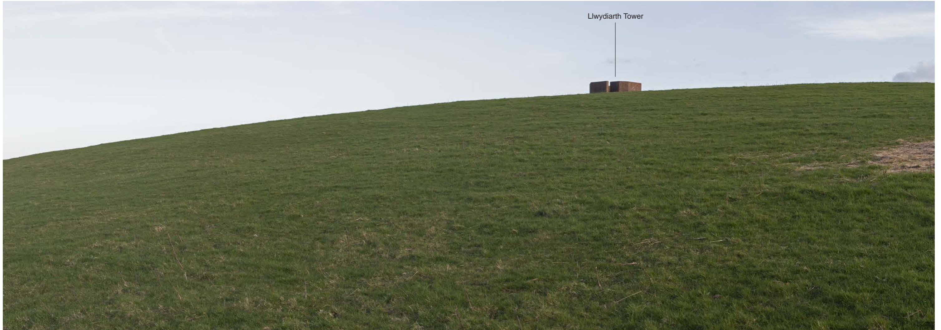
Representative Viewpoint 18 (Right Centre) - Public footpath LLANNERCH-Y-MEDD|25/002/1 near Pen-y-Foel and Llwydiarth Tower

Approximate extent of Maen Hir South 'A'