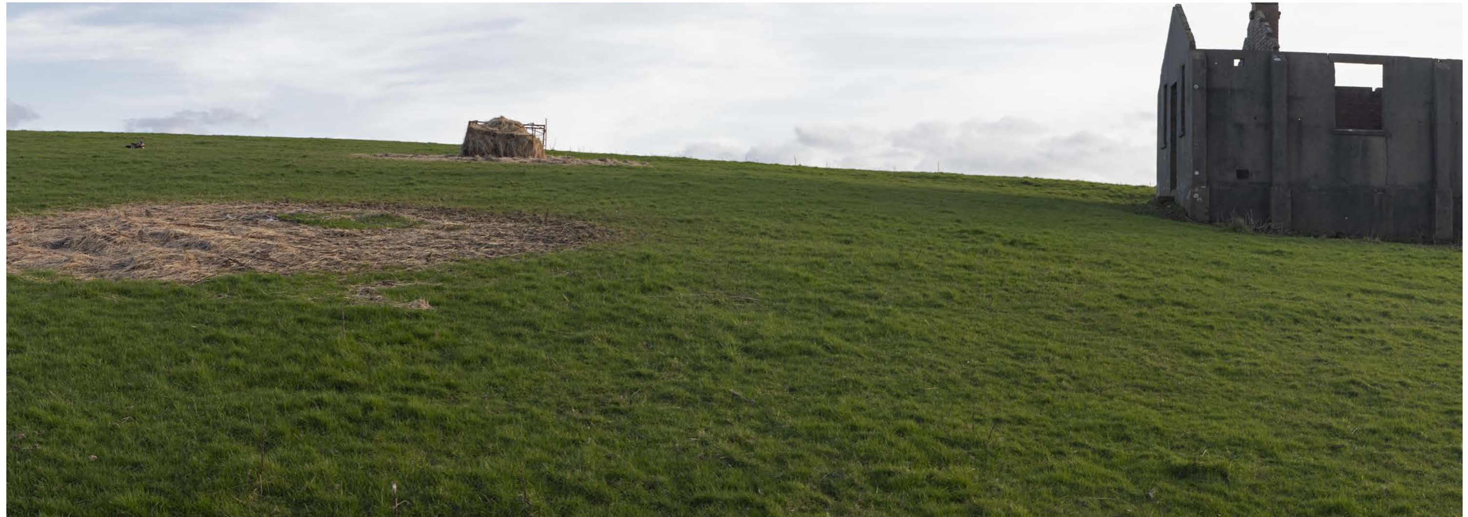
Representative Viewpoint 18 (Right) - Public footpath LLANNERCH-Y-MEDD|25/002/1 near Pen-y-Foel and Llwydiarth Tower

ISSUED BY Bristol T: 0117 2033 628 DATE September 2024 DRAWN BF PAGE SIZE 420mm x 297mm CHECKED RF STATUS Final APPROVED RF