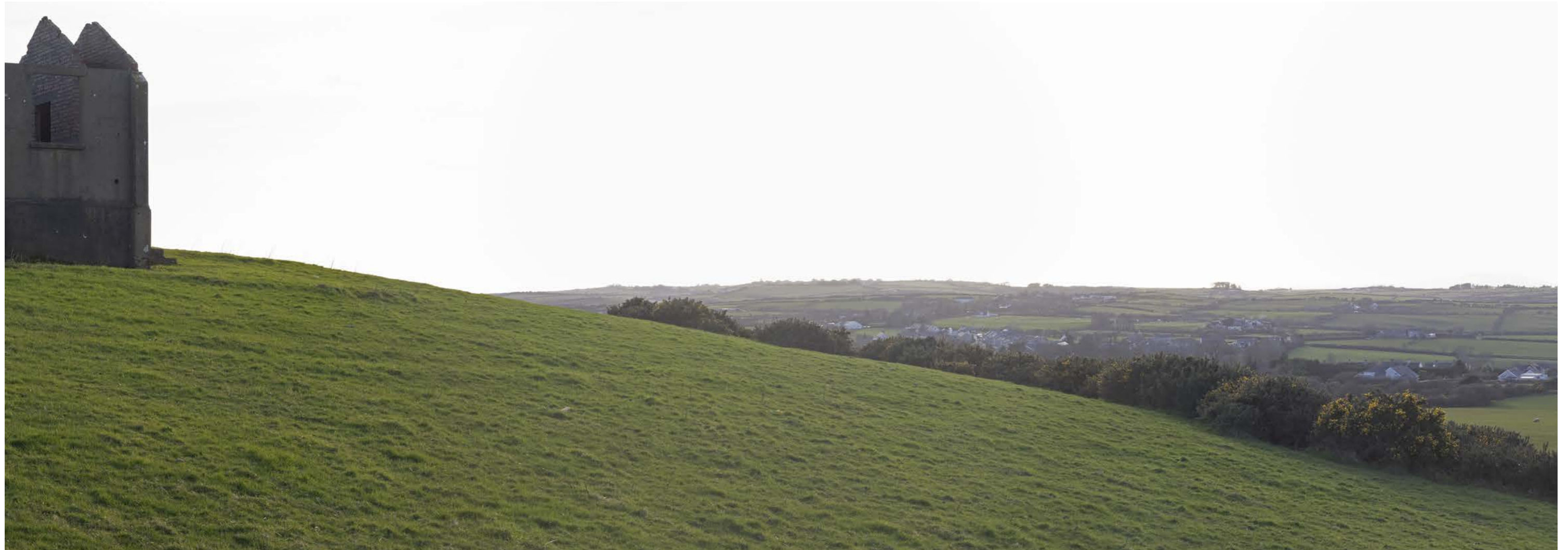
Representative Viewpoint 18 (Left) - Public footpath LLANNERCH-Y-MEDD|25/002/1 near Pen-y-Foel and Llwydiarth Tower