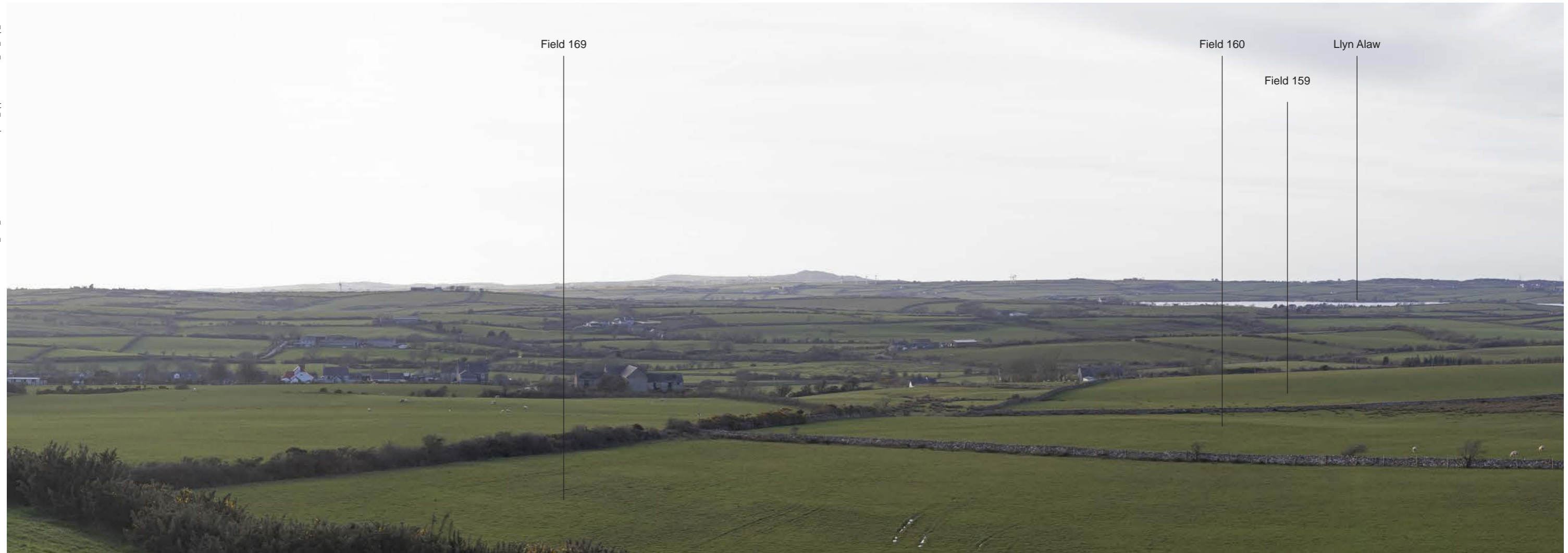
Representative Viewpoint 18 (Left Centre) - Public footpath LLANNERCH-Y-MEDD|25/002/1 near Pen-y-Foel and Llwydiarth Tower

Z:\8888_Mon_Solar\6docs\LIAPEIR\Viewpoint_Appendices\8888_VP_Rep_18.indd