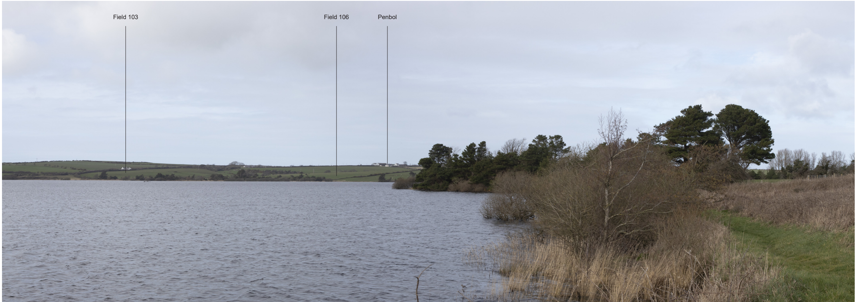
Representative Viewpoint 14 (Centre) - Public footpath LLANNERCH-Y-MEDD|25/036/1 and Penwerthyr Nature Area to south of Llyn Alaw reservoir

ISSUED BY Bristol T: 0117 2033 628 DATE September 2024 DRAWN BF PAGE SIZE 420mm x 297mm CHECKED RF STATUS Final APPROVED RF