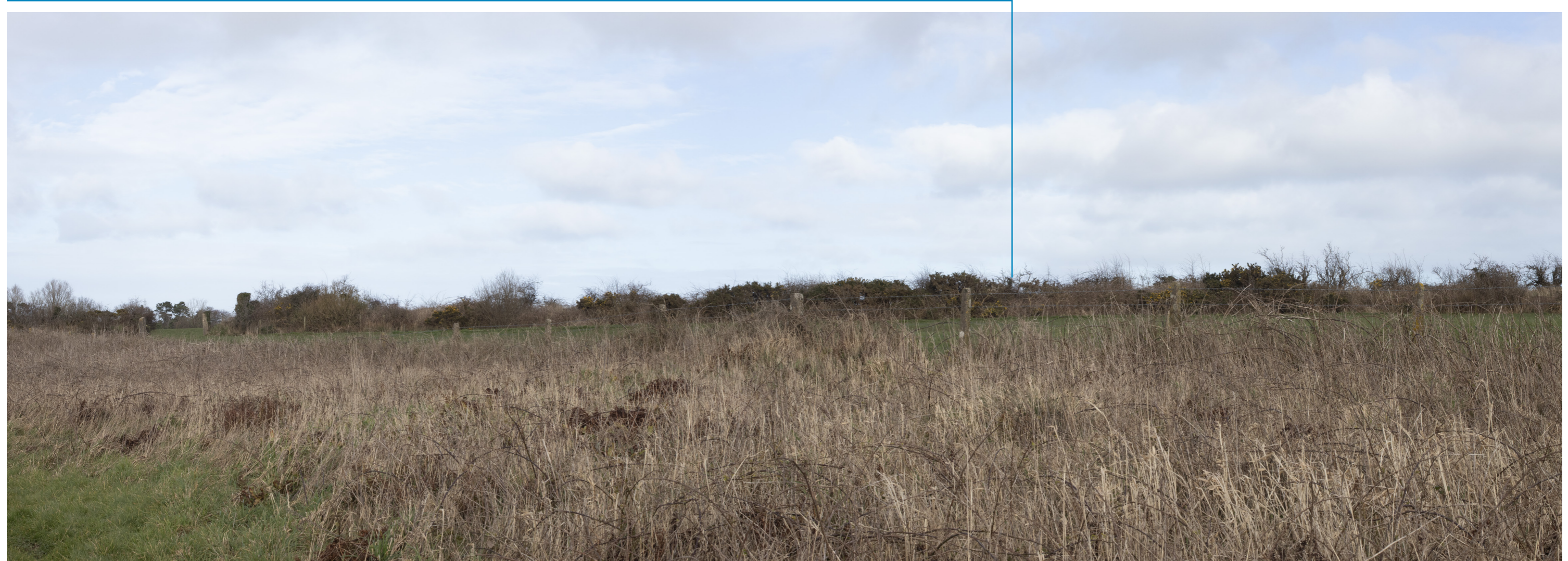
Representative Viewpoint 14 (Right) - Public footpath LLANNERCH-Y-MEDD|25/036/1 and Penwerthyr Nature Area to south of Llyn Alaw reservoir

ISSUED BY Bristol T: 0117 2033 628 DATE September 2024 DRAWN BF PAGE SIZE 420mm x 297mm CHECKED RF STATUS Final APPROVED RF