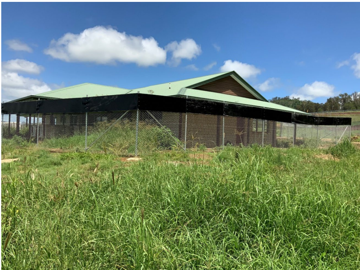
Woolooga Solar Farm, Lower Wonga, Queensland (EPBC 2019/8554)